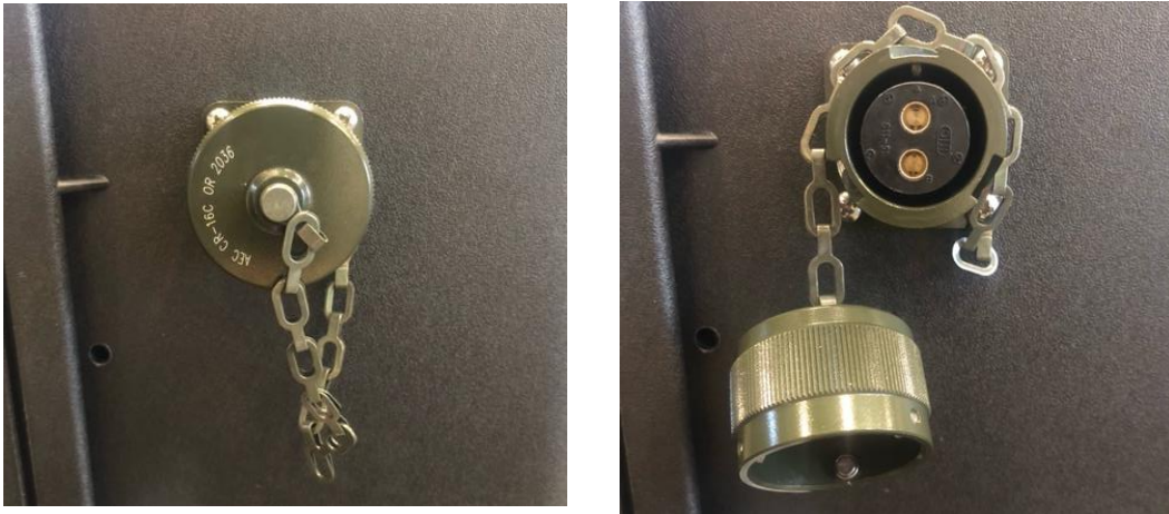
Figure 3: DC Input/Output Connector