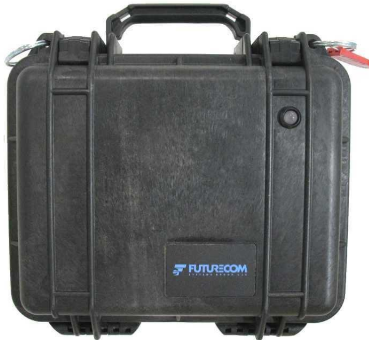
Figure 2: Battery Pack

The AC to DC battery charger is used to charge the internal batteries from a 120V AC source. NOTE: A step-down transformer and an AC plug adapter (if required) are supplied for countries with 220V to 240V AC mains.