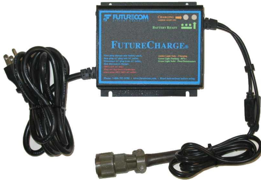
Fig. 3 Battery Charger